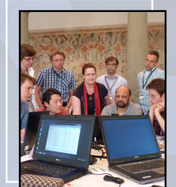
Hands-on Simcyp workshop: The intersection of science, software and drug development